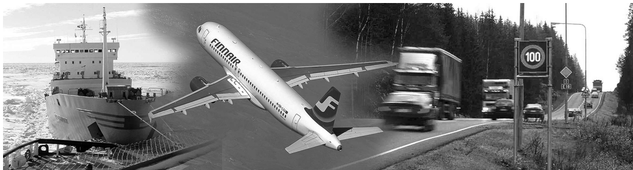
VTT carries out transport research in all transport modes.

VTT uses the latest information technology when developing production-oriented information systems supporting decision-making for the optimal control of transport. Methods related to systems research are used at the strategic, tactical and operative levels. Fleet management (FM) is applied in a physical network, where vehicles move following a given task list.