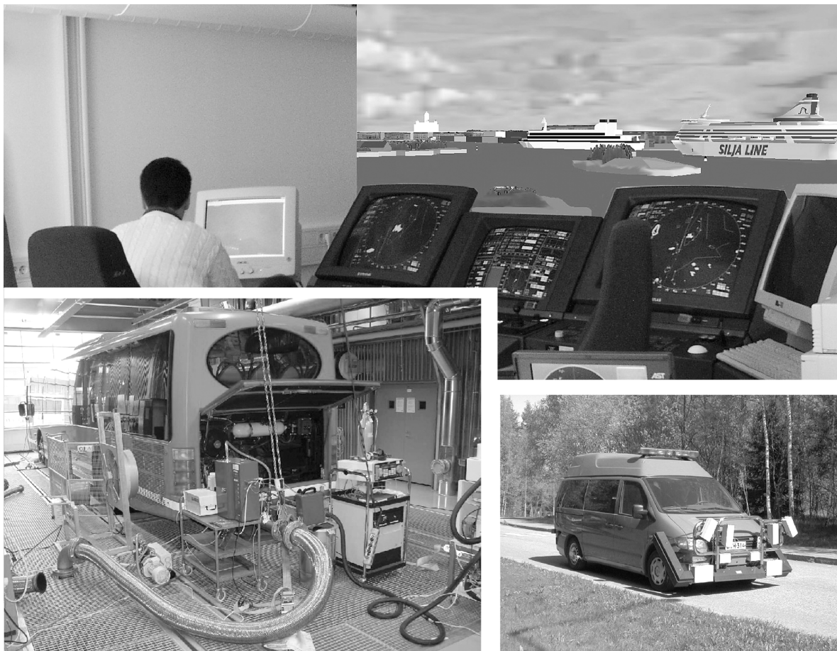
Ship handling simulator, test facilities for energy use and emissions from heavy vehicles as well as road surface measurement system are examples of the variety of VTT research facilities.