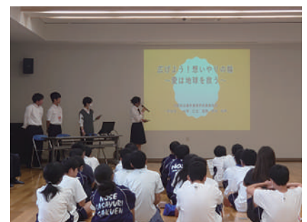
Traffic safety education for junior high school students