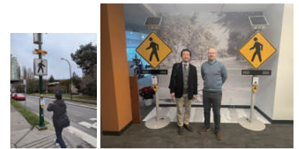
On-site surveys and hearings in North America