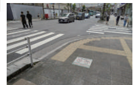
Survey of Traffic Conditions at Unsignalized Intersections in Japan