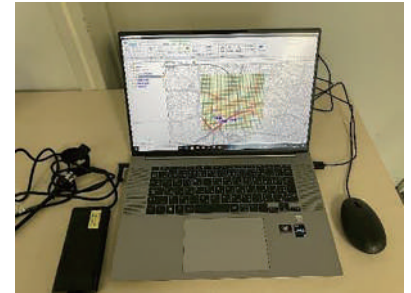
Trial operation of the Traffic Guidance and Enforcement Activity Support System