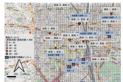
Rate of enforcement activities conducted at proposed system locations