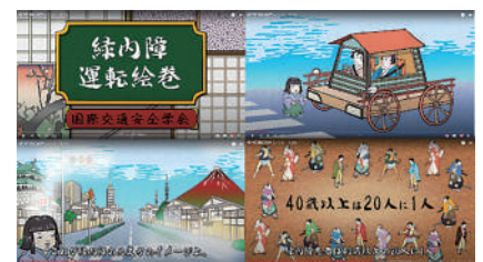
Driving Scroll with Glaucoma

Explore our collection of awareness videos in the 'Video Archive' section at the IATSS website.