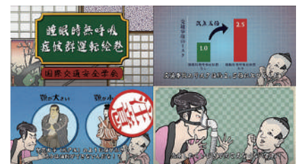
Driving Scroll with Sleep Apnea Syndrome