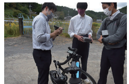
Explaining the handling of measuring instruments

In addition, we conducted a study on behavioral changes related to safe bicycle use among high school students, utilizing naturalistic data. Through this research, we observed an increase in helmet usage and positive changes in riding behavior for hazard avoidance.